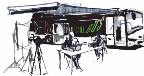
Marquis to enlarge the work space and protect equipment against bad weather