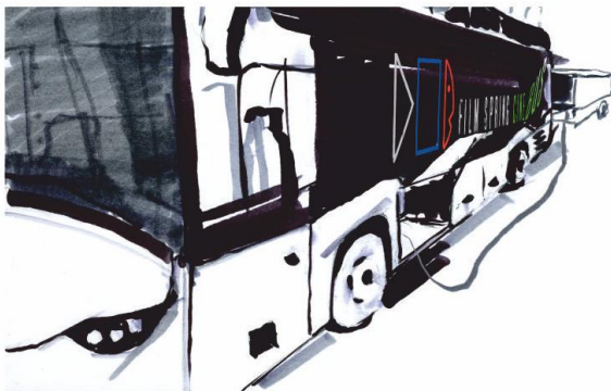
Electrical switchboard in luggage compartment