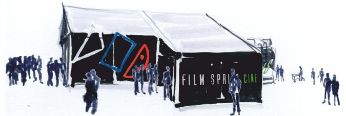
Tent can be used as screening area or green - screen studio