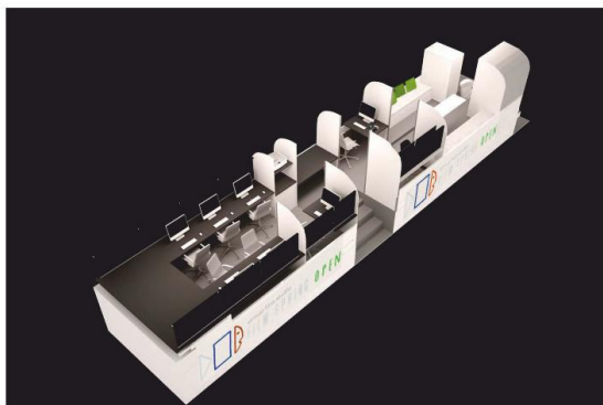
Division of the Bus interior into different production units