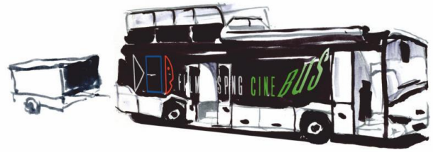
Electric generator towed behind