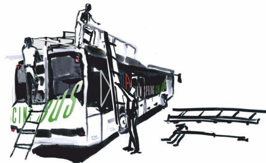
Roof rack for Long pieces of equipment