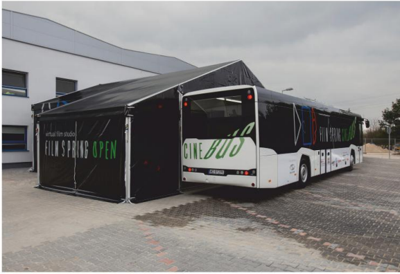
The Cinebus – mobile film studio