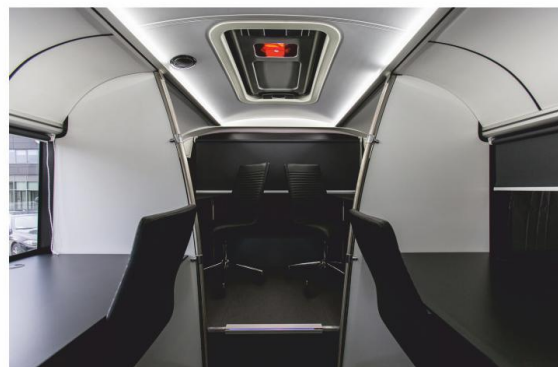
Workplace for Editing, Color Correction and CGI