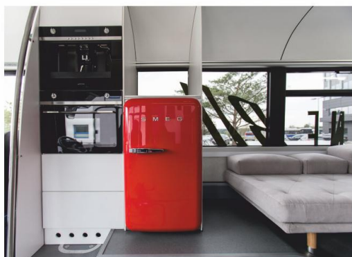
Enjoy with us cup of coffee!