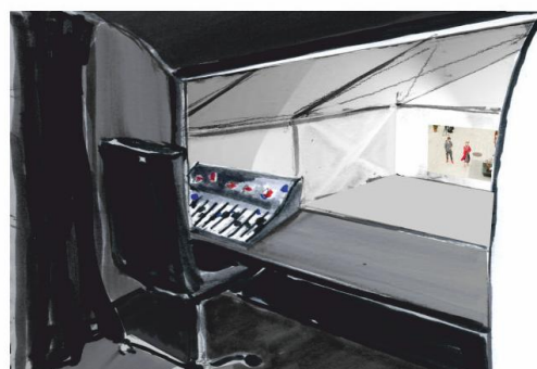
Sound engineer's cabin