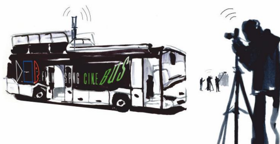
Rooftop antenna receiving camera covers 200 m area