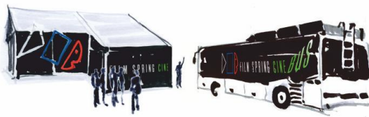
Bus docking to a tent at the end of shooting day