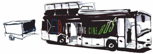
Electric generator towed behind